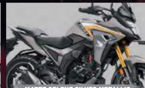
MATTE SELENE SILVER METALLIC